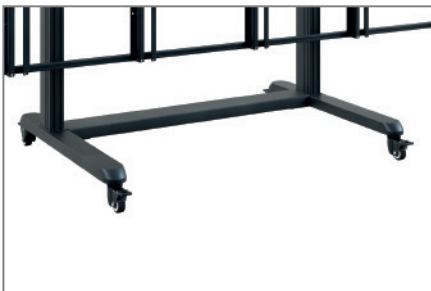
mobile thanks to castors with lock-type brake

In addition to the pre-configured systems, HAGOR offers customised special solutions in the LED sector, which can be individualised with accessories such as loudspeakers, controls and so on to meet all requirements.